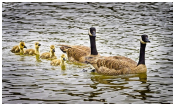
Canada Geese (above) and Mallard Ducks