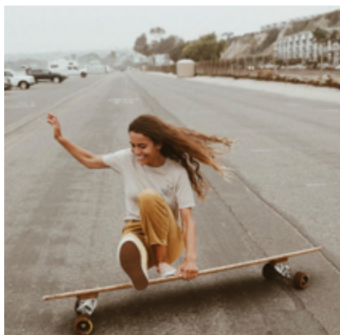
Rip'n at South Day Use