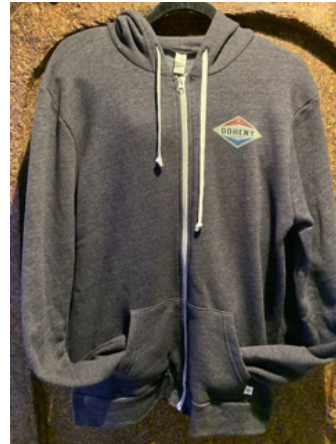
Hoody $39 $31.20

Next Doheny VW Pop-Up Store on the Promenade, Saturday, February 22 nd from 10 AM to 1 PM.