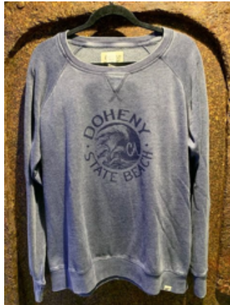
Sweat Shirt. $39 $31.20