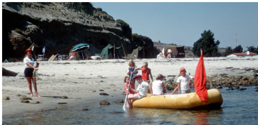
Casting Off from the Bone Yard, 1953

BE SMART DURING THE RAINY SEASON: Health officials advise against ocean water contact for up to 72 hrs. following a significant rain event due to increased bacteria levels, especially near harbors, drain pipes, and river mouths.