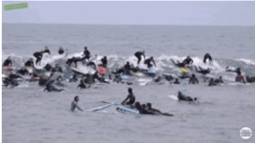
Could be a day at Doheny.

CALIFORNIA STATE PARKS FOUNDATION: As most of you know, DSBIA is a member of California State Parks Foundation. Here are three links to interesting articles in their last newsletter. Research provides critical data and new information for California to leverage its state parks as a public health solution. https://www.calparks.org/what-were-doing/research Urge Governor Newsom to make park access for all a priority by supporting Assembly Bill 209 (Limón) and Assembly Bill 556 (Carrillo). https://www.calparks.org/how-you-can-help/act-now Photo of the Month Contest! https://www.calparks.org/stories-and-victories/photo-contest