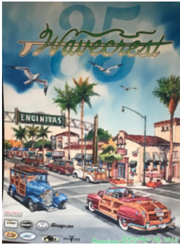
Encinitas 18"x 24"