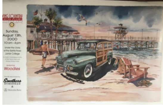
San Clemente Pier 21" 13"