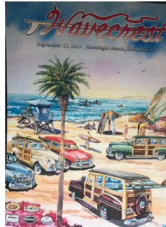
Moonlight Beach 18"x 24"