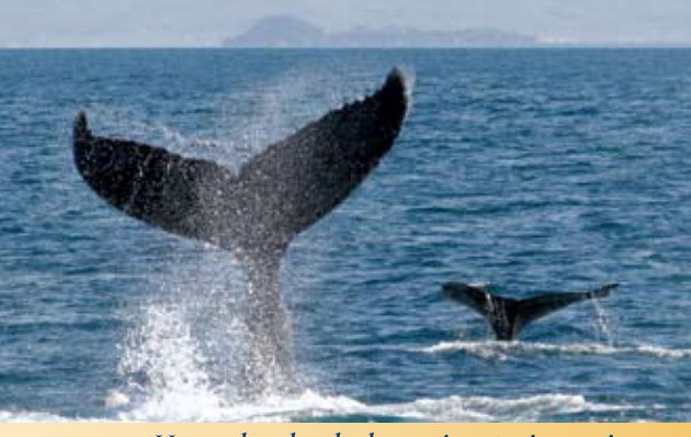
Humpback whales migrate in spring.

Dana Point became home to surfing legends like surfboard maker Hobie Alter and Endless Summer filmmaker Bruce Brown. As a surf spot memorialized in the Beach Boys' hit Surfin' USA , Doheny's beach enjoyed spectacular pipelines and point breaks until the Dana Point harbor breakwater was built in 1966. During the summer, Doheny surf still breaks consistently.