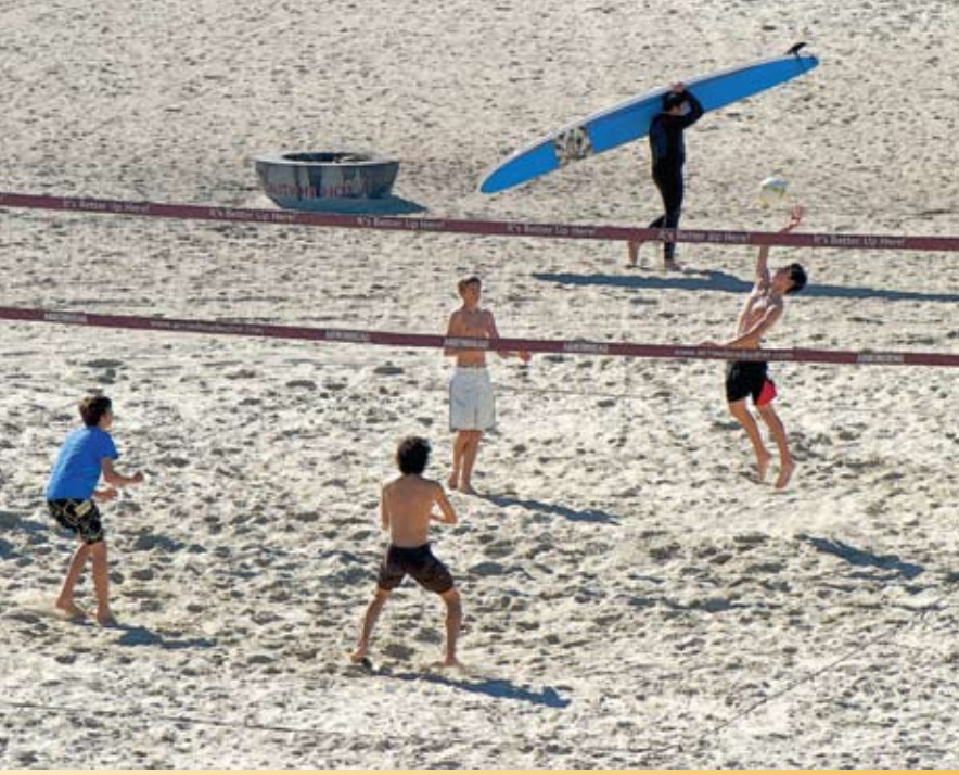
Beach volleyball is a popular sport at Doheny.