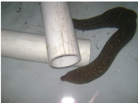
Pepe the moray checking out its temporary digs